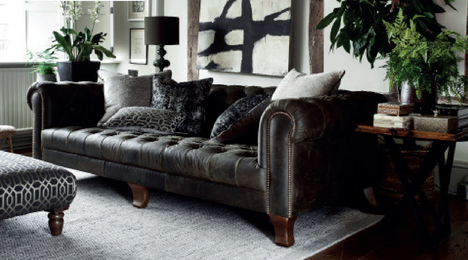
VIVIENNE MAXI SOFA SHOWN IN JIN BLACK LEATHER WITH FABRIC OPTION 1 AND DARK WOOD FEET